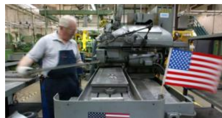
RECESSION?! Here's new proof the US economy is stronger than you think