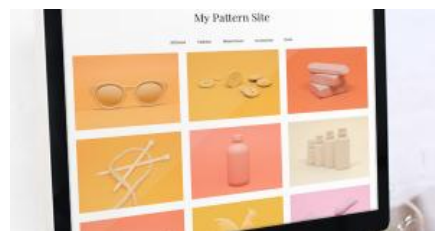
E-commerce site Etsy is launching its first ever month-to-month paid s ...