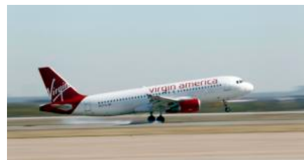
It's all good news for investors of the American airline oligopoly