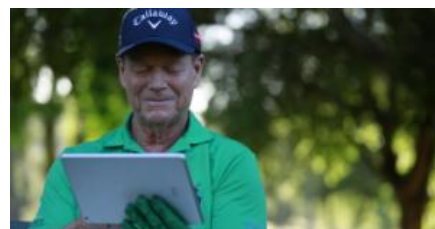
IBM Watson links up with Tom Watson at The Masters