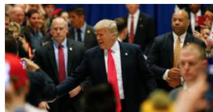
Trump's not wrong about a 'massive recession'